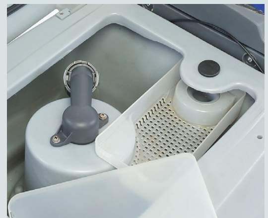
An integrated debris catch cage traps and collects drain clogging debris.

For use on extreme soil levels (10% of scrubbing applications)