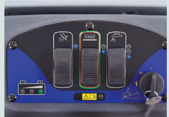
The SC750 ST / SC800 ST – provides simple operation and robust scrubbing controls.

Advance's rugged, low-maintenance SC750™ and SC800™ scrubbers deliver incredible value on a walk-behind platform. High productivity per tankful allows for 84 minutes of continuous scrubbing, which reduces dump/refill cycles and helps provide fast ROI. The SC800 model is available with EcoFlex™ System which offers the flexibility to clean across the entire cleaning spectrum from green to clean. At the touch of a button one can switch from chemical free cleaning to using an ultra low dilution ratio, and of course detergent can be used at full strength for the toughest of soils. The burst of power feature lets you easily apply more pressure, more solution and more detergent at the touch of a single button. With the flexibility to easily apply the right scrubbing performance for the job, you'll use less detergent, minimize water use and save on cleaning costs.